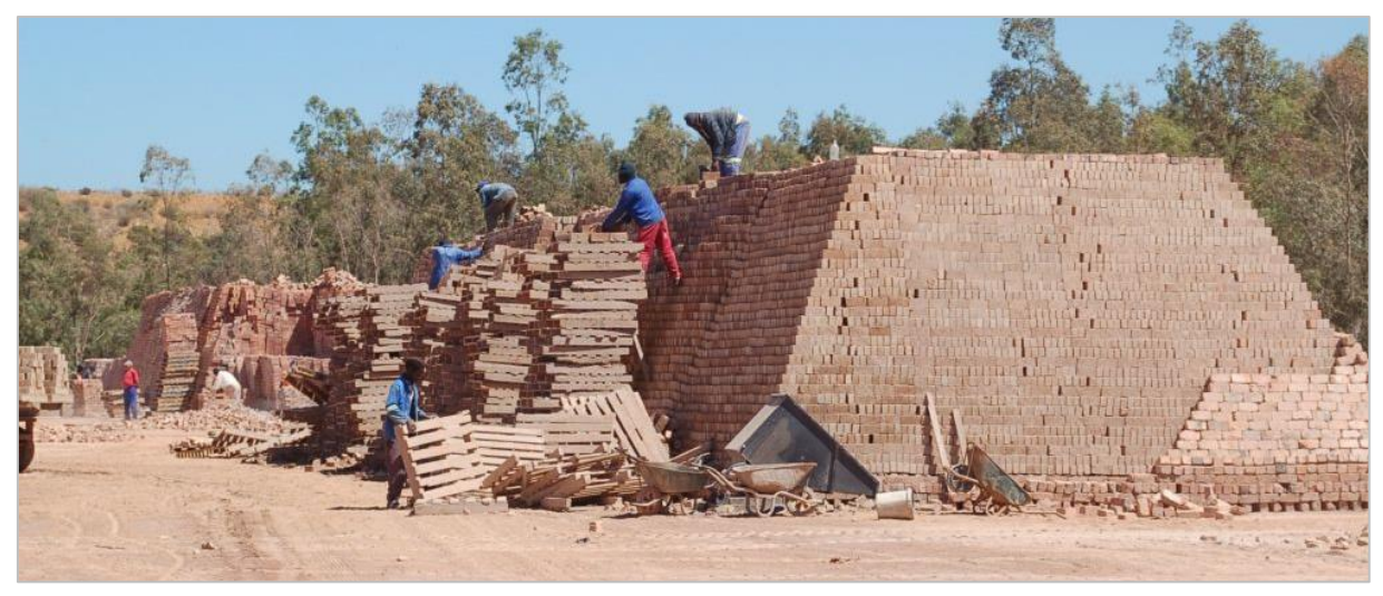
Figure 1: Open air clamp kiln.

The emission of toxic air pollutants such as, sulphur dioxide, nitrogen oxides and particulate matter (dust and smoke) presents a risk to human health and has a negative environmental impact. Inhalation of these air pollutants can result in respiratory problems and heart disease and also the acidification of rain due which can damage crops, forests and soil. Moreover, acid rain entering water bodies rivers, can also lead to the largescale death of aquatic animals. The main sources of air pollution in clay brick production are quarrying and brick making activities, such as raw material preparation and brick firing. Brick firing, particularly those using low-grade coal, can be a source of sulphur dioxide and nitrogen oxide emissions.