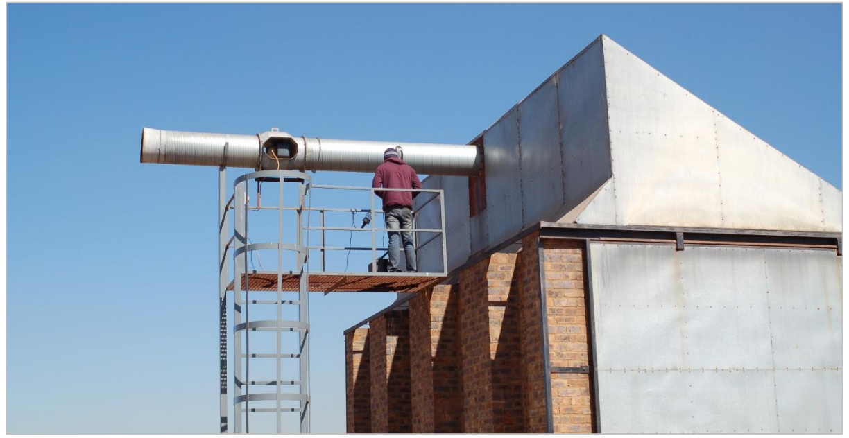
Figure 3: University of Pretoria students take readings at the model kiln

Input data for different brick factories across South Africa was collected, including data about methods of raw brick processing and packing, the intrinsic properties of the "green" bricks (such as moisture content and clay type) and the type of fuel used. Thirteen successful firings were completed, each lasting for 8-14 days. To ensure a realistic range of variables, the raw bricks, packing pattern and the firing technique were provided by eleven separate CBA Members (Akinshipe and Kornelius, 2007).